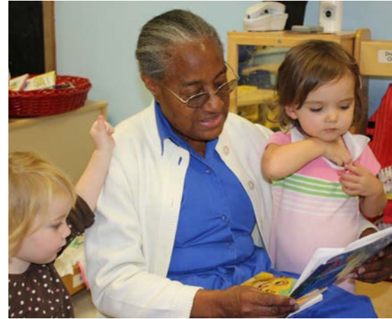
Foster Grandparent Program

During the program year, 81 volunteers served 62,304 hours. Foster Grandparents serving in an afterschool program assisted two children in meeting the academic goals outlined in their assignment plans. Grandparents in the elementary education program assisted 70 children, of which 95% showed improvement in the areas of math, literacy, and appropriate social behavior. Grandparents in pre-elementary school programs assisted 31 children with delayed motor skills, inappropriate social skills and/or delayed developmental skills; 90% showed improvement in their identified areas. In an additional program focused on developmentally disabled children, four children served by grandparents showed improvements in speech, language, motor and emotional development.