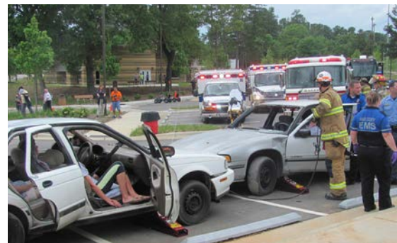
Raleigh Youth Council

Funds were used for land acquisition and construction of these greenway trails. The Neuse River Greenway Trail offers scenic views of the Neuse River, winding boardwalk areas through wetlands, historical sights, interpretive signs, and agricultural fields. In addition to being part of the City's Capital Area Greenway System, it is a segment of the Mountains-to-Sea Trail, which is a long distance trail that runs across North Carolina from the Great Smoky Mountains to the Outer Banks. The Walnut Creek Trail provides connections from the Neuse River Trail to the Walnut Creek Amphitheater, Walnut Creek Softball Complex, Walnut Creek Wetland Center, Pullen Park, Lake Johnson Park, NC State Centennial Campus, the Farmers Market, the NC Museum of Art, and Umstead State Park. A portion of the US Department of Transportation grant was funded under the American Recovery and Reinvestment Act (ARRA).