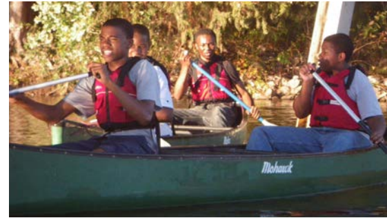
Teen Outreach Program

DRIFT (Drive Responsible Initiative for Teens), an initiative led by the Raleigh Youth Council, is designed to promote behaviors and attitudes in teen drivers that result in reduced risk while operating motor vehicles. Through this effort, over 10,000 teens heard the initiative's safe driving message; 74 teens participated in safe driving classes focusing on DWI, distracted driving and speeding led by the Raleigh Police Department; 2,047 signed safe driving pledges were collected from over 40 high schools; 572 surveys were conducted to find out teens driving habits and views; and two mock crash events were hosted. Participants also attended a weekend driving school to strengthen their safe driving habits. Other collaborators on this grant include the City's Police, Information Technology, and Community Service departments, local schools and external organizations.