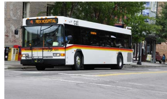
Capital Area Transit

The Emergency Ride Home program, which provides commuters who regularly vanpool, carpool, bike, walk or take transit with a ride home if an unexpected emergency arises, saw 30 new commuters join the program. Share the Ride NC, a statewide rideshare matching service, added 187 new registrants to the database for downtown Raleigh. Zipcar, a carsharing program, was launched with two vehicles in February 2013. As of June 30, 2013, we had 64 members who had used the vehicles 1,127 hours.