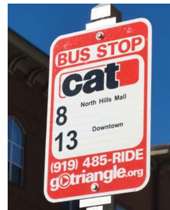
Transit Passenger Amenities

During the program year, funds were used to support transit planning activities and expenses related to staff positions as well as the preventive maintenance of fleet, vehicle replacement, replacement radios and shop tools, and bus shelter equipment. Tasks completed by transit planning staff included research and development of the unified planning work program and transportation improvement program, monitoring and updating Title VI and environmental justice plans, and annual collection of transit system data needed for national transit reporting and for safety and security reporting. In addition, long range planning elements were developed for the Capital Area Transit System. These include financial, population, and employment forecasts. These funds also provided support for transit planning efforts associated with student populations.