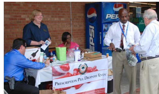
Pill Drop Event

This grant, awarded by the NC Department of Public Safety and funded by the US Department of Justice, addressed the illegal sale of prescription drugs, including prescription forgery, straw purchases, and doctor shopping. Detectives conducted 17 investigations, conducted two pill-drop events to collect unwanted or expired prescription drugs and over-the-counter medications, and distributed information about how to prevent prescription drug diversion. The pill drop off events resulted in the collection of nearly 150,000 pills. Grant funding also paid for equipment to enhance the detectives' investigative efforts and improved their safety.