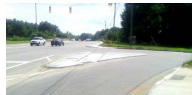
I-440 Ramp Curbs & Pedestrian Refuges

This grant provided construction of approximately 3.3 miles of sidewalk in high priority areas along Wake Forest Road, Falls of Neuse Road, Wade Avenue, Lake Boone Trail, Poole Road, Fox Road, New Hope Church Road and Calvary Drive.