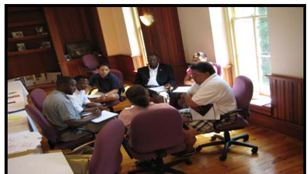
Southeast Raleigh Assembly Leaders at July 2008 Retreat

It is about children learning about the most recent inventors of recent years. Click and Learn!