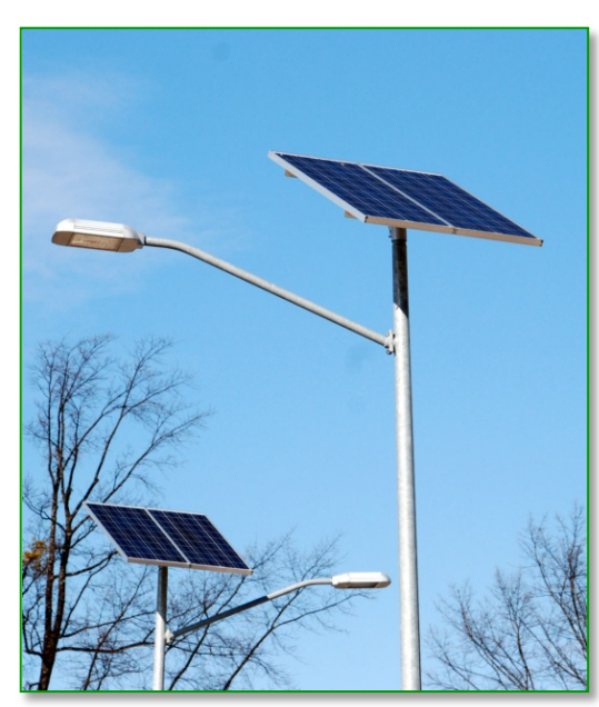
Solar LED Street Lights