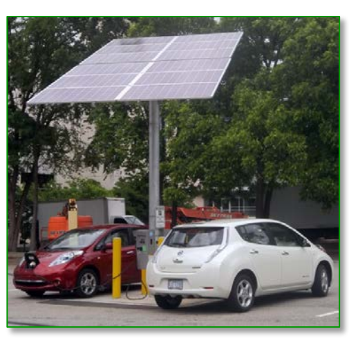
Solar EV Charging Station