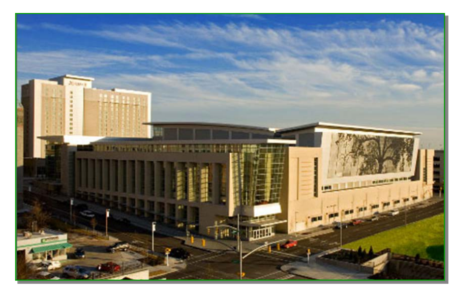
Raleigh's LEED Silver Certified Convention Center